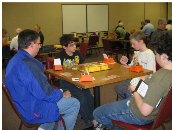
Bridge Players: The Next Generation