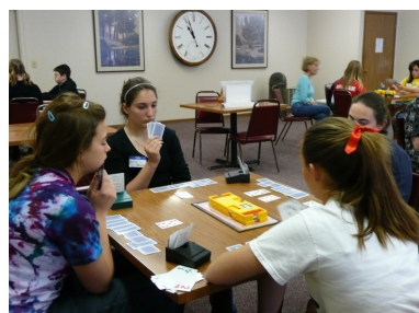
Deep in Thought